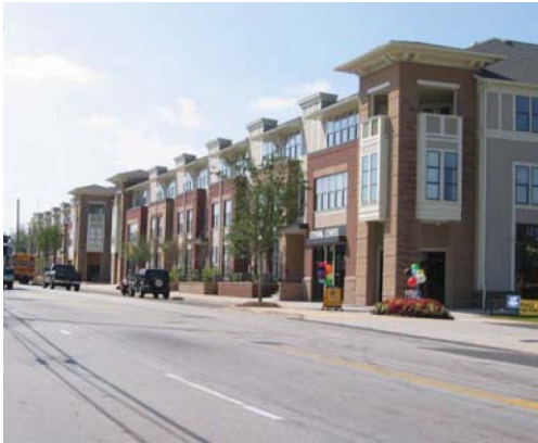
Figure 5:1 Mixed-use development helps to activate public streets