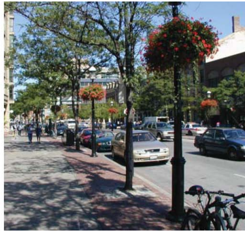
Figure 5:7 Wide sidewalks and street trees make a street inviting for pedestrians