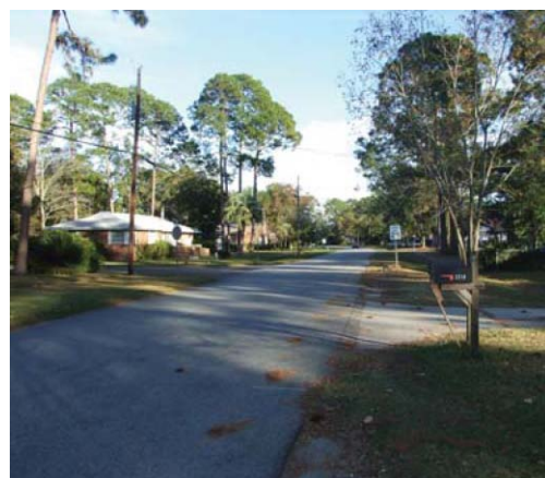
Figure 5:4 Single family neighborhoods with consistent setbacks for homes