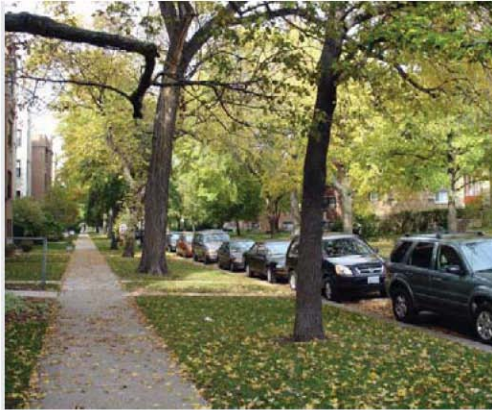
Figure 5:15 Great neighborhood streets have ample tree cover and good sidewalks