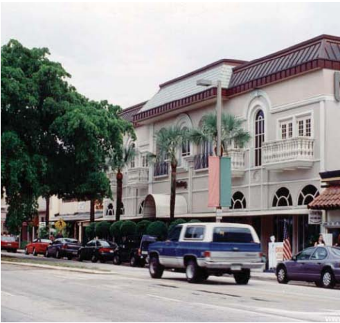
Figure 5:6 Buildings adjacent to the sidewalk enliven a corridor

A study has been completed along the Glynn Avenue/ US Route 17 Corridor that is proposed to be adopted by the City Commission.