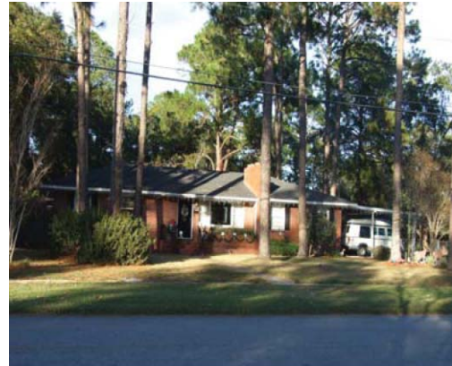
Figure 5:2 Single-family home on wooded lot