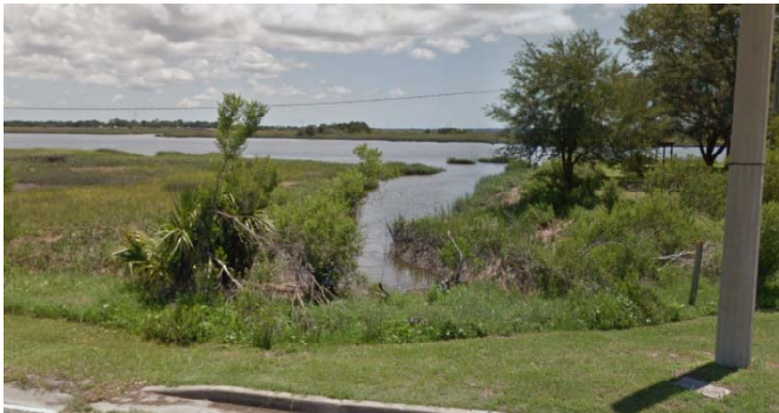
Figure 5:20 View of the Marsh and Tidal Creeks adjacent to US 17 and Overlook Park

Conservation Preservation Districts, as described in the City's Zoning Ordinance, were established and maintained to preserve and/ or control development within certain land, marsh, and/or water areas of the City which serve as wildlife refuges; possess great natural beauty or are of historical significance; area utilized for recreational purposes; provide needed open space for the health and general welfare of the City's inhabitants; or are subject to periodic flooding. Regulations apply within this district designed to reserve such areas and to discourage any encroachment by residential, commercial, industrial, or other uses capable of adversely affecting the relatively undeveloped character of the district.