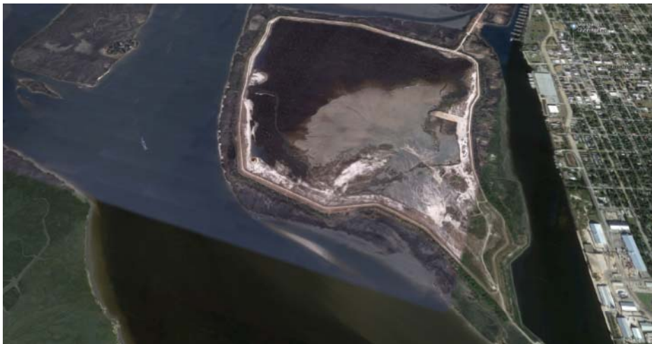
Figure 5:19 Andrews Island, East River