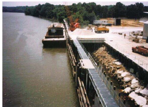
Figure 5:17 Industrial Waterfront and pier