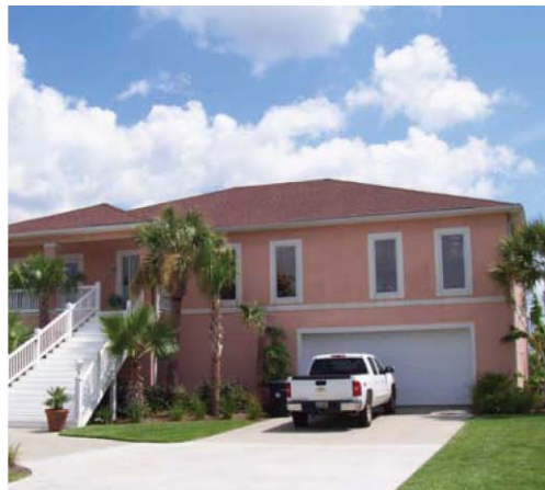
Figure 5:5 Single-family homes in Riverside display a variety of modern coastal styles