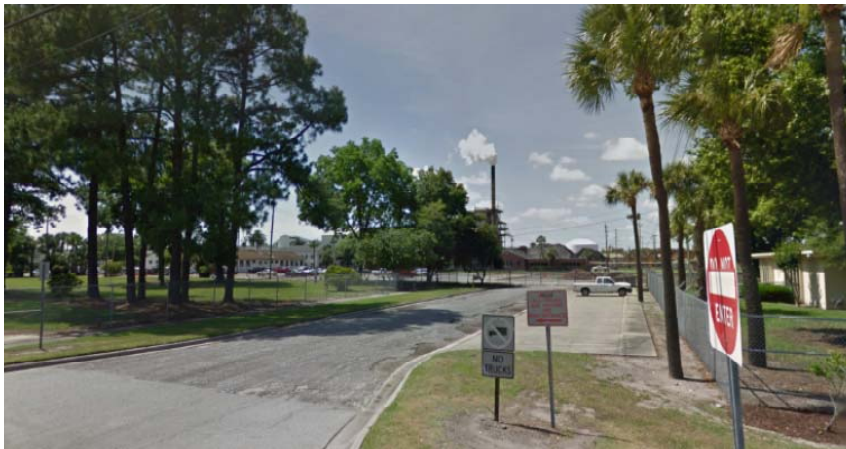
Figure 5:8 Hercules/Pinova manufacturing facility