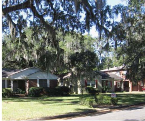
Figure 5:16 Single-family housing typical of South End Brunswick