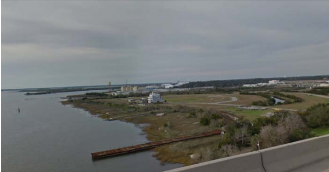
Figure 5:18 Liberty Harbor future development site