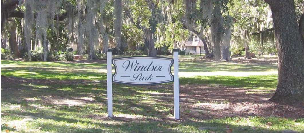
Figure 5:12 Windsor Park, the heart of the Windsor Park Character Area