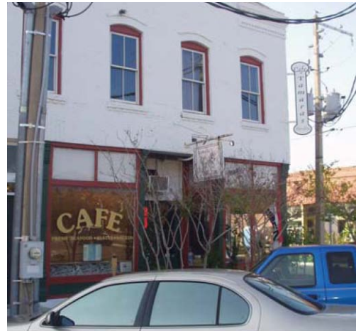
Figure 5:10 Corner stores contribute to a sense of place and are pedestrian scaled