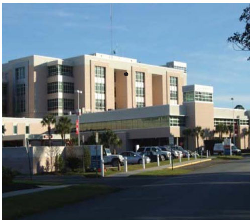
Figure 5:3 Medical land uses are an important part of the Parkwood character area