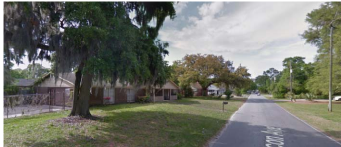
Figure 5:11 Typical single-family residential in Urbana/Mayhew Character Area