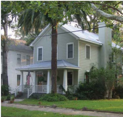
Figure 5:9 Single-family houses with porches could provide good infill for New Town