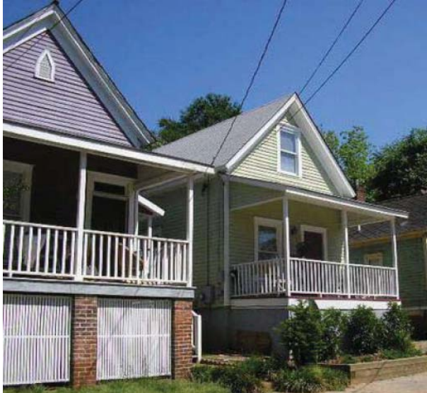
Figure 5:13 Infill development should complement existing neighborhood character