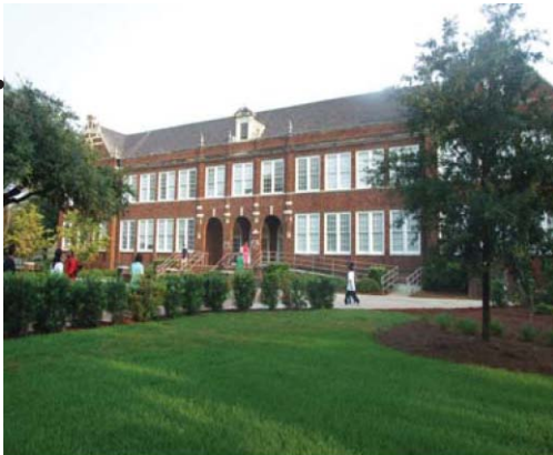
Figure 5:14 Civic uses should have traditional architecture and be pedestrian friendly