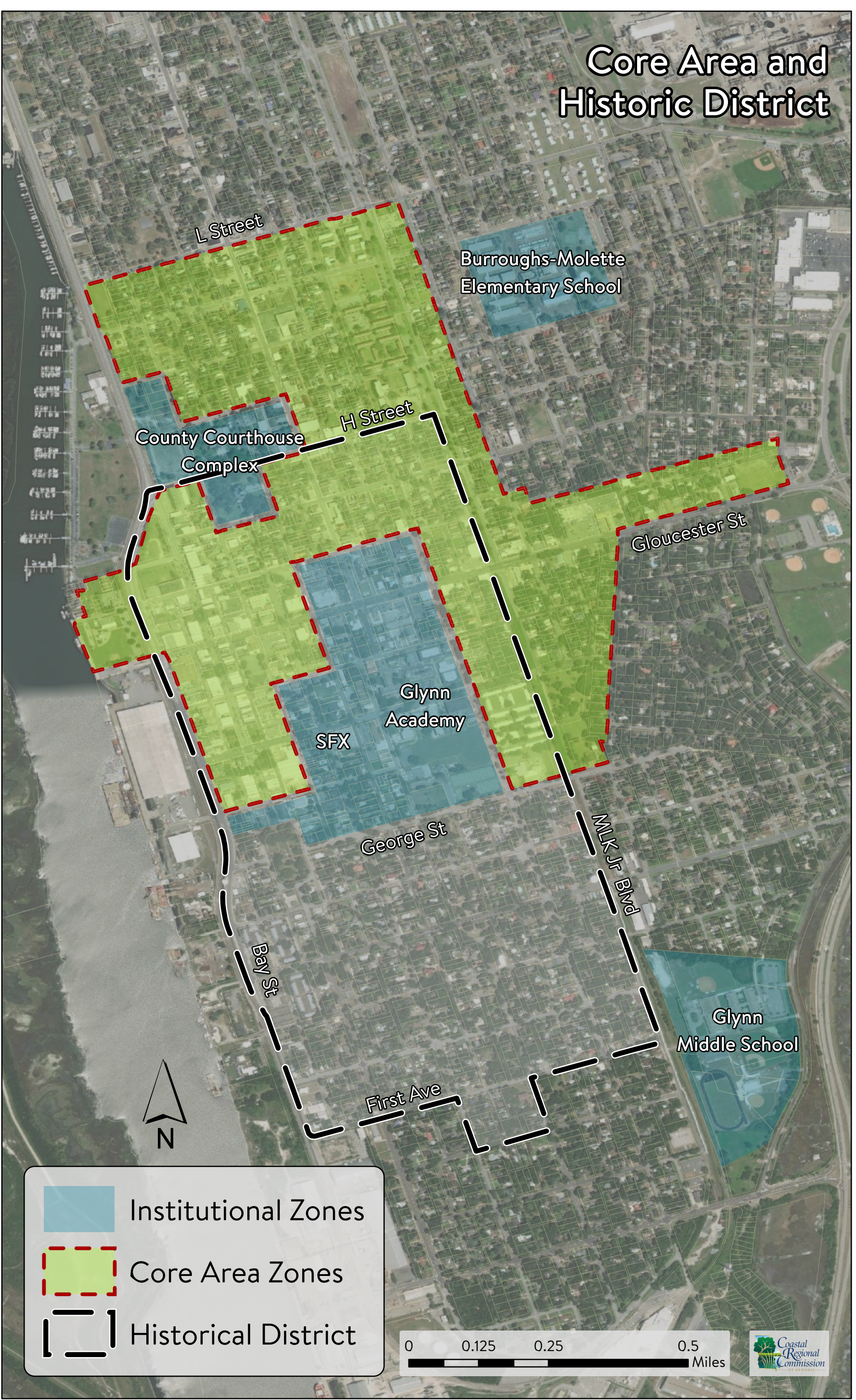
Produced in 2022 by the Coastal Regional Commission GIS Department (CRC GIS). All information portrayed in this product is for reference only. Therefore, CRC GIS will not be held liable for improper use of the data provided herein. The data and related graphics are not legal documents and should not be utilized in such a manner. The information contained herein is considered dynamic and will change over time. It is the responsibility of the user to use the products appropriately. T:\ags_resources\Glynn\Brunswick Insitutional Areas Map\Brunswick Insitutional Areas Map\